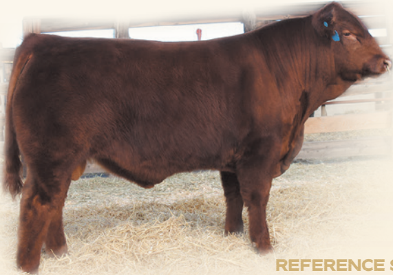
REFERENCE SIRE WULFS APOSTLE 343A

This page of bulls is truly a unique sale highlight! These five maternal and four full brothers are all from the heart of our progressive embryo transfer program. They all stem from the prolific WZRK Miss Nascar 8012U donor dam that has continued to produce at the highest level as evidence not only by these five exceptional individuals that carry a rare combination of phenotypic quality, elite EPD's and unmatched predictability but, also our Lot 1 sale feature. To take it one step further, we'd like to take this opportunity to introduce our lead herd sire Wulf's Apostle - he is the sire to many throughout this sale offering and also four in this particular pen. Apostle was the top selling herd bull in the 2014 Wulf sale where he was admired by many for his combination of structural integrity, body depth and muscularity. We think his progeny speak to both his quality and consistency. That said, we are excited to showcase these very first Apostle calves to sell at public auction for your appreciated appraisal.