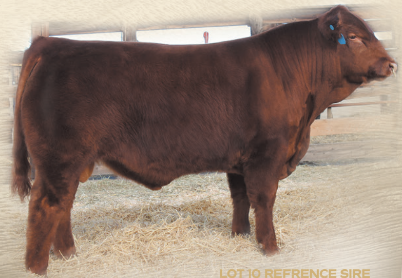
LOT 10 REFERENCE SIRE WULFS APOSTLE 343A

Well balanced, is the term that best describes this fresh pedigreed son of Wulf's Apostle. Phenotypically, he is flat shouldered, level down his top, thick-ended and long sided. On paper, he ranks in the top 15% or better for weaning weight, milk, calving ease maternal, yield grade and rib-eye area. We think this red hided herd bull prospect does a lot right.