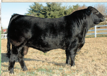
WULFS XCLUSIVE 2458X