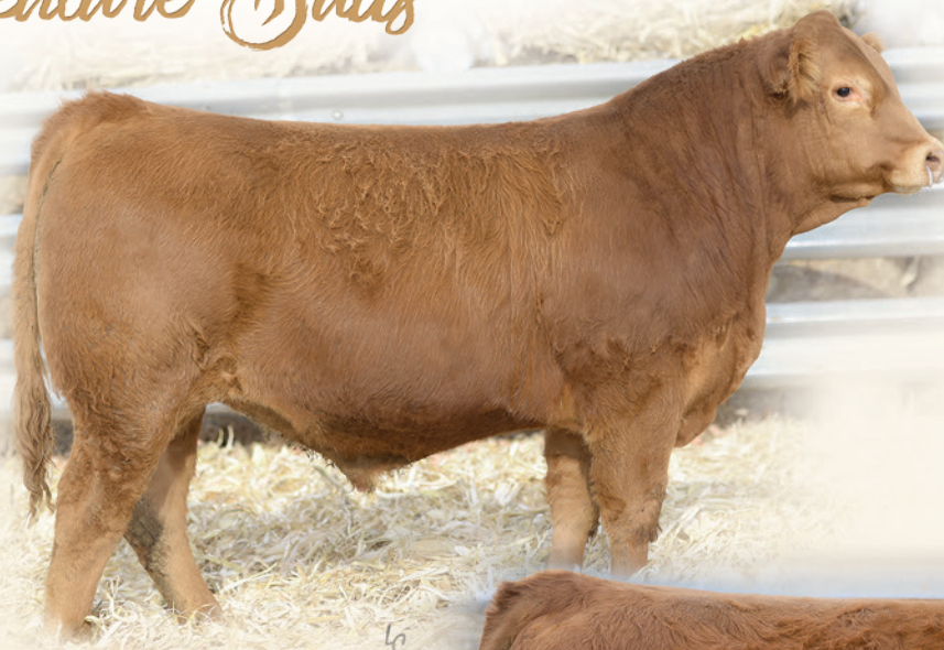
LOT 2 WZRK CHANGE AGENT 1054C