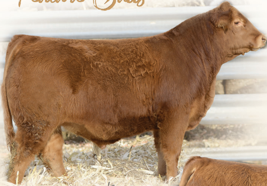
LOT 6 WZRK CORNERSTONE 2065C