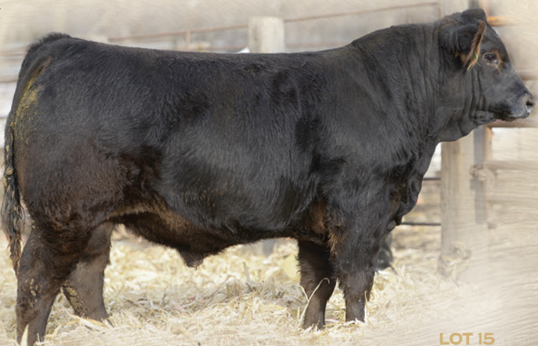
LOT 15 WZRK CUP O JOE 8255C

If you like good footed, great fronted, long bodied, deep sided cattle that are homozygous polled, then watch for this exceptional son of Xerox. Numerically, notice he excels in his calving ease, birth weight and rib-eye EPD's which all rank in the top 15% of the entire breed. Point blank, this herd sire prospect projects to sire slick headed, sound made calves with plenty of muscle.