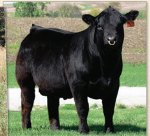
CJSL WILD WEST