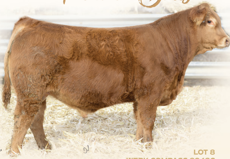
LOT 8 WZRK COMPASS 8048C

Study this attractive made herd sire prospect that combines rib and muscle to the highest degree. To the eye, Compass is moderate made, big bodied, muscular and easy fleshing. On paper, he is highlighted by an impressive 764 lbs. of adjusted weaning and a rib-eye EPD which ranks in the top 3% of the entire breed.