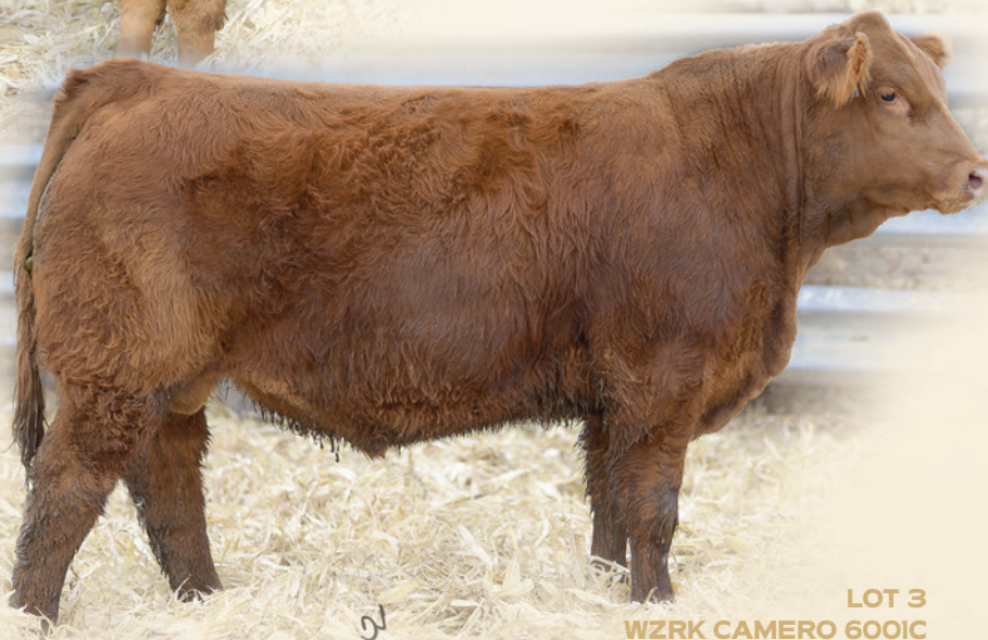
LOT 3 WZRK CAMERO 6001C