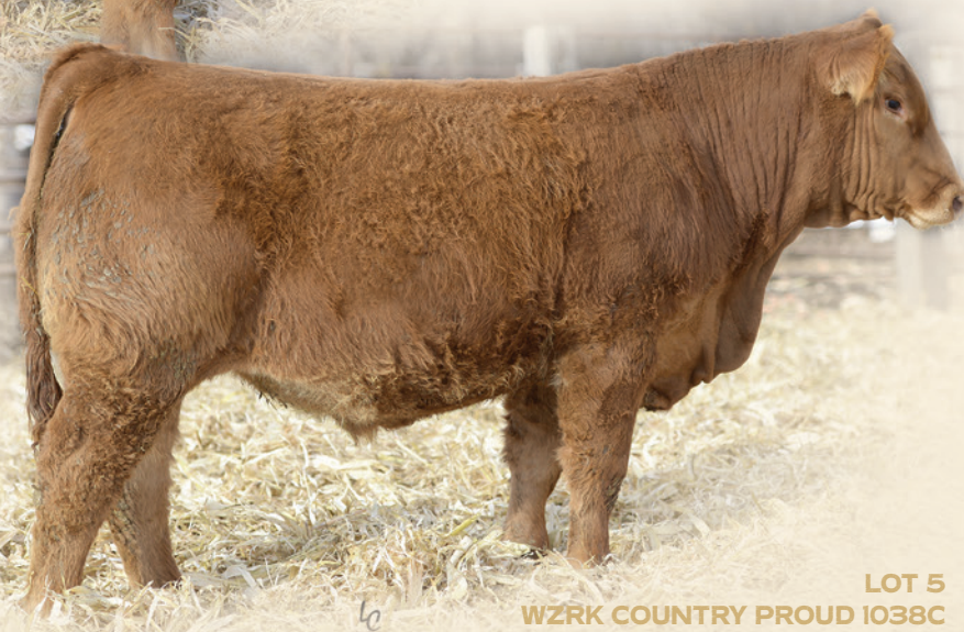
LOT 5 WZRK COUNTRY PROUD 1038C