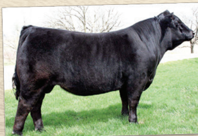
DLVL XEROX 023X