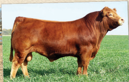
WULFS XTRACTOR X233X