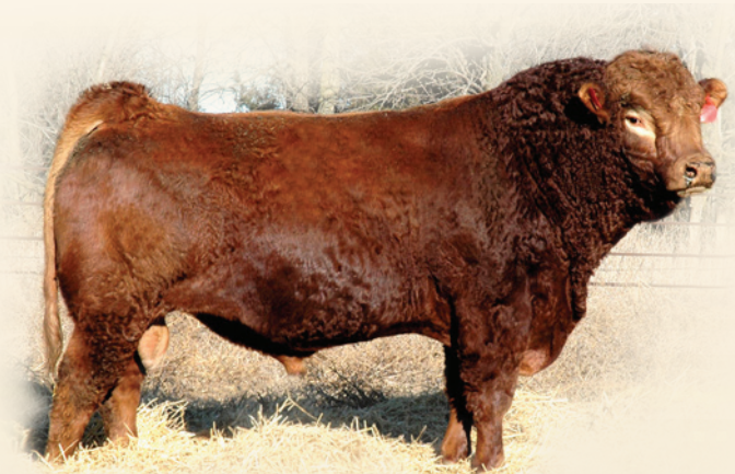
REFERENCE SIRE ROMN TUFF ENUFF 103T

These two exceptional sons (lots 27 and 28) are by our lead calving ease herd bull, ROMN Tuff Enuff 103T. Note, he has instilled the very same calving ease advantage in these sons and it's with confidence we offer his sons to commercial cattlemen seeking low birth weight calves. Sale day as you walk through the docile Tuff Enuff Sons we think you'll appreciate their consistency - almost all of them are smooth shouldered, long bodied, level made and carry both birth weight and calving ease EPD's ranking in the top 10% of the breed or better.