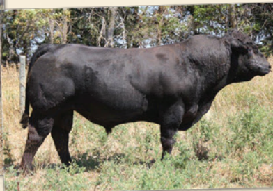
AHCC XPLAIN THIS