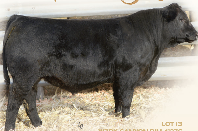
LOT 13 WZRK CANYON RIM 4127C

Turn your attention to this exceptionally well designed, homozygous polled son of the highly popular MAGS Y-Axis A.I. sire that appraised for $48,000. Visually, Canyon Rim is big footed, smooth shouldered, wide topped and bold ribbed. On paper you can appreciate the numerical balance he offers ranking in the top 25% or higher for WW, YW, MK, SC, CW and RE.