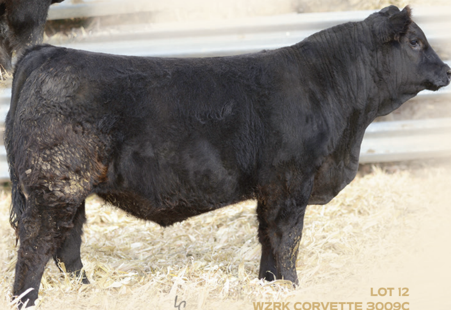
LOT 12 WZRK CORVETTE 3009C