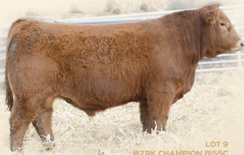
LOT 9 WZRK CHAMPION 8155C

If you came looking for a homozygous polled feature bull that could be considered heifer safe then Champion is the herd sire prospect for you. Visually, he's smooth shouldered, level hipped and good footed. Take a look at both his calving ease and birth weight EPD which rank in the top 20%. As an added bonus, note he posted a 32 for his milk EPD which places him in the top 10% of the entire breed.