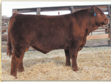
WULFS APOSTLE T343A