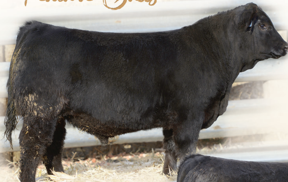
LOT 11 WZRK CHEVY 2015C