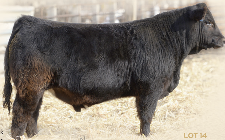
LOT 14 WZRK CAPPUCCINO 0051C

Study this homozygous polled, athletic moving, great fronted, black hided son of the highly popular, A.I. sire Wulf's Apostle. Aside from his phenotypic advantages, on paper he combines a user friendly 86 pound birth weight and charts over 700 lbs of adjusted weaning weight. EPD-wise, he is highlighted by his calving ease maternal figure which is in the top 1% and his top 3% milk figure.