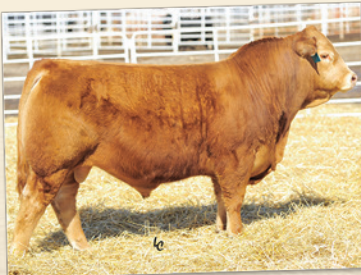
WZRK ATLAS 8012A