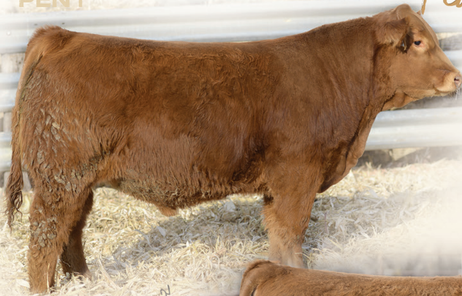
LOT 4 WZRK CAPSTONE 9018C