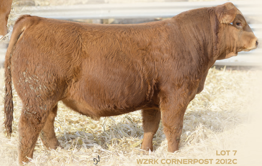
LOT 7 WZRK CORNERPOST 2012C